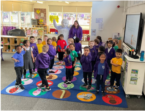
The Easter Bunny arrived in our Reception class