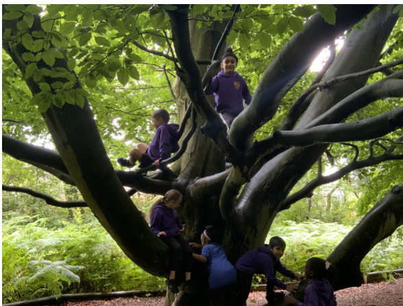
Yellow Class visit to Kingswood

We ask all parents to book their child's lunch on Parentmail, prior to the day. This can be found in Accounts, Dinners. Please make your choices and pop them in your basket and proceed to checkout/payment. Regardless of whether you pay for your child's dinners, you must still make the choice and checkout for the order to be placed with school.