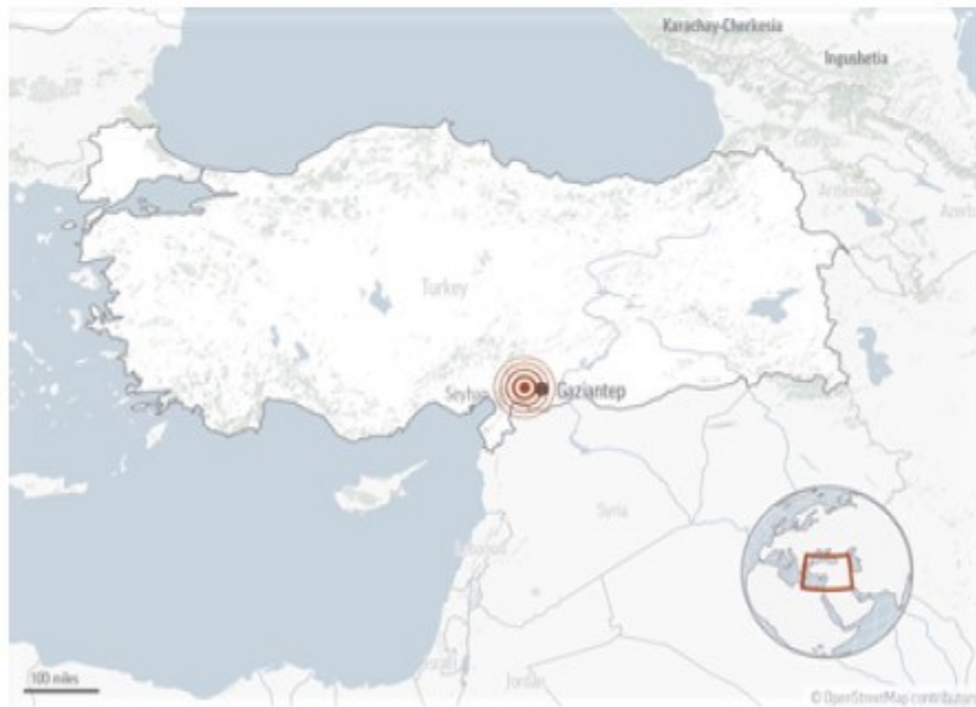
Pictured above: The location of the two earthquakes

The two massive earthquakes affecting Turkey and Syria have had a huge impact on the countries. At least 2,800 buildings are thought to have been destroyed and schools in 10 cities are to be shut for a week to keep people safe. Many airports have been closed as well. The earthquakes were also felt in other countries, including Cyprus, Lebanon and Israel.