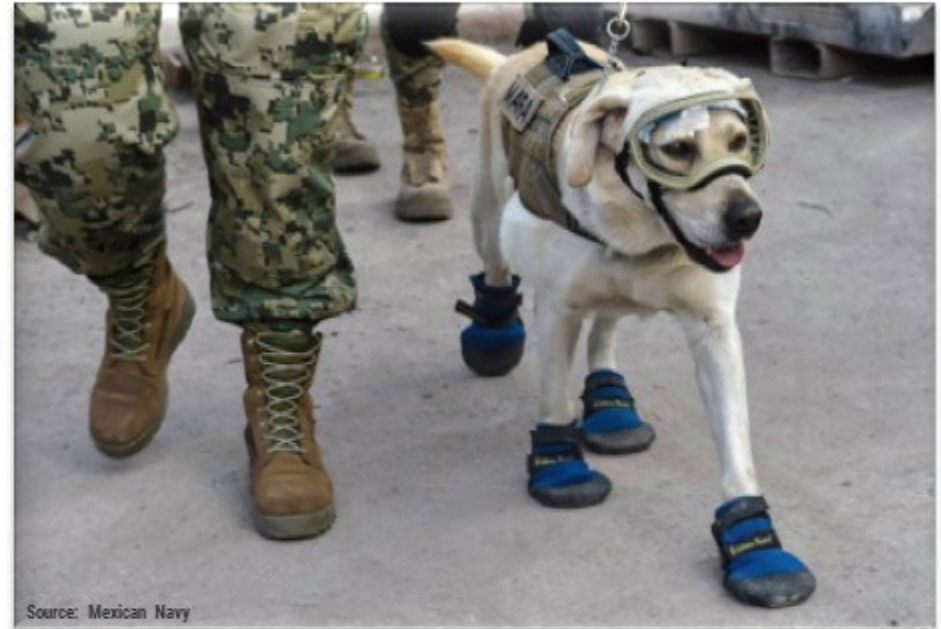
Pictured below: Frida the rescue dog