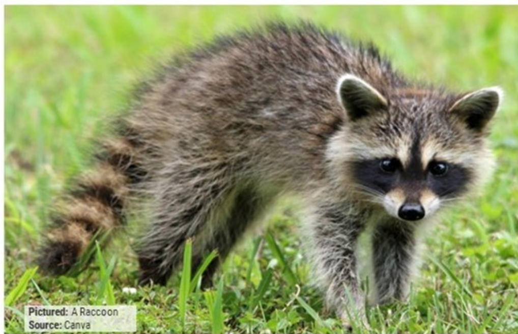
Pictured: A Raccoon