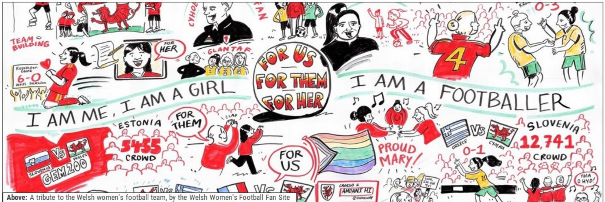
Above: A tribute to the Welsh women's football team, by the Welsh Women's Football Fan Site

A joint statement from Wales men and women's teams.