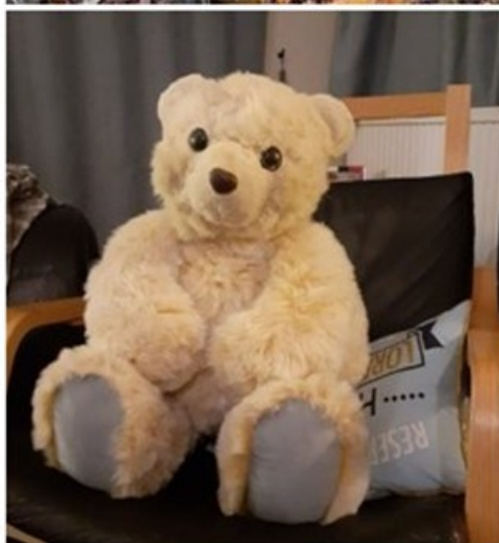
Pictured: Sinbad - before and after his restoration.