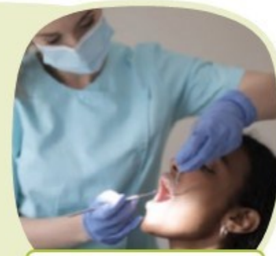
A dentist and their patient

Someone who examines and treats people's teeth.