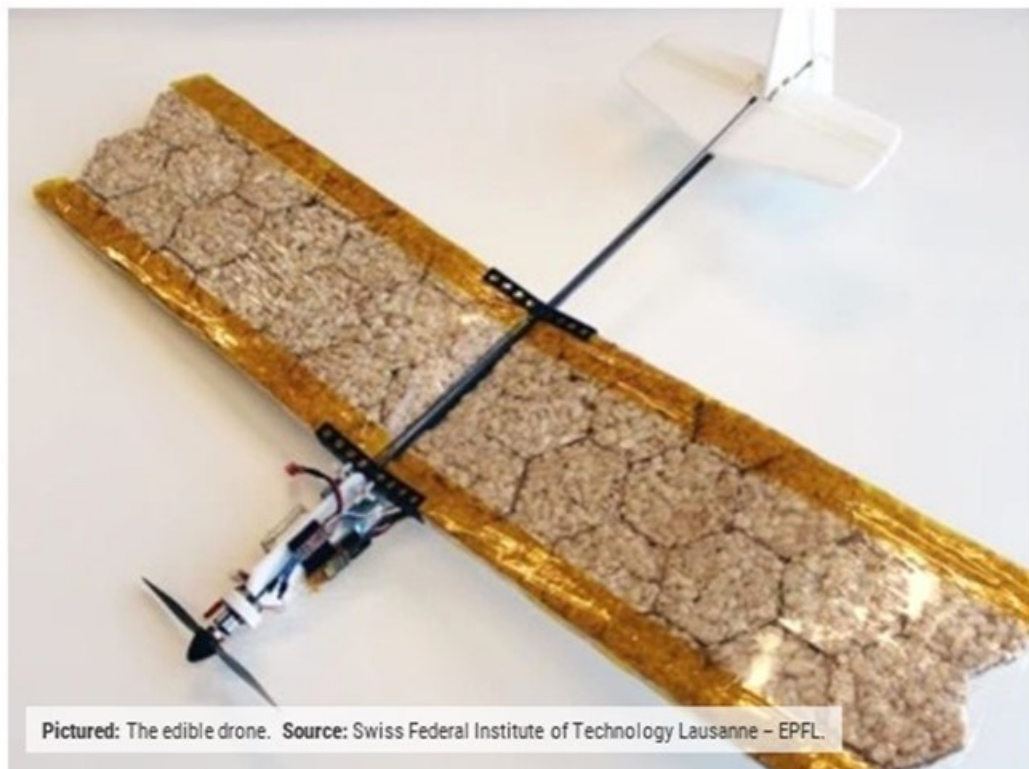
Pictured: The edible drone.

the atmosphere becomes charged and an electrical discharge of plasma is created between an object and the air around it. St. Elmo's fire is named after St. Elmo (the patron saint of sailors) as the phenomenon, which can warn of an imminent lightning strike, is often seen on aeroplanes and ships. It was traditionally regarded by sailors with awe and sometimes considered to be a sign of good luck.