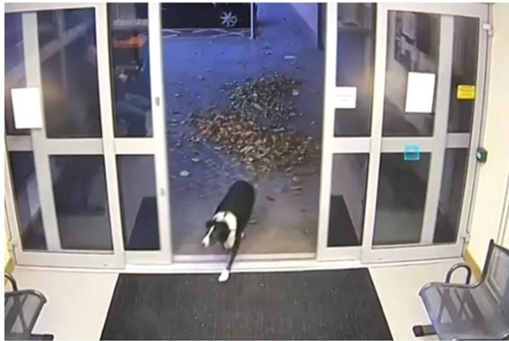
Pictured: Rosie walking into the Police Station.