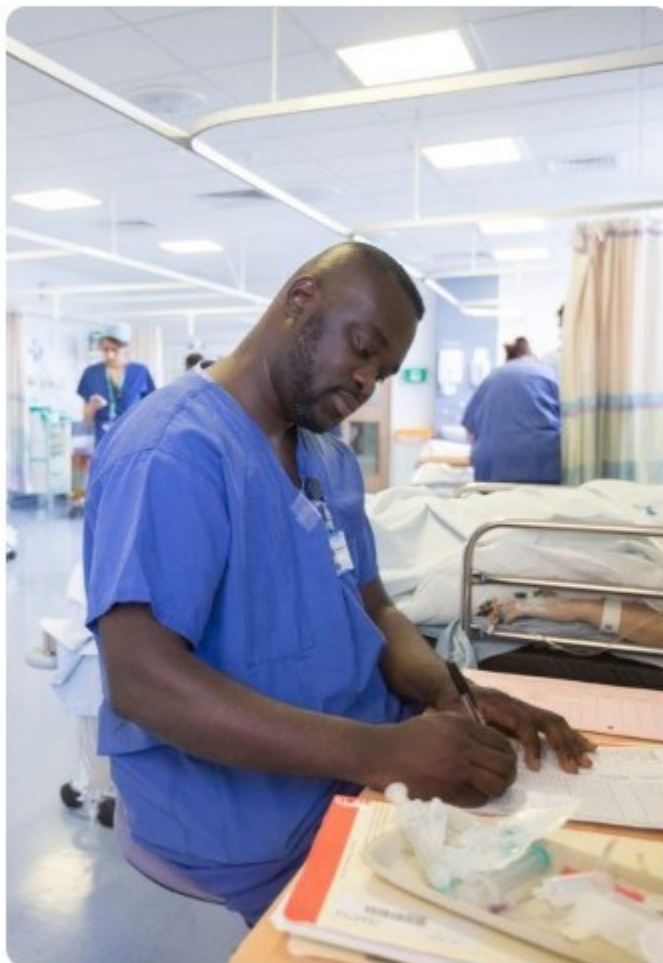
Pictured: A team of nurses working a hospital shift.