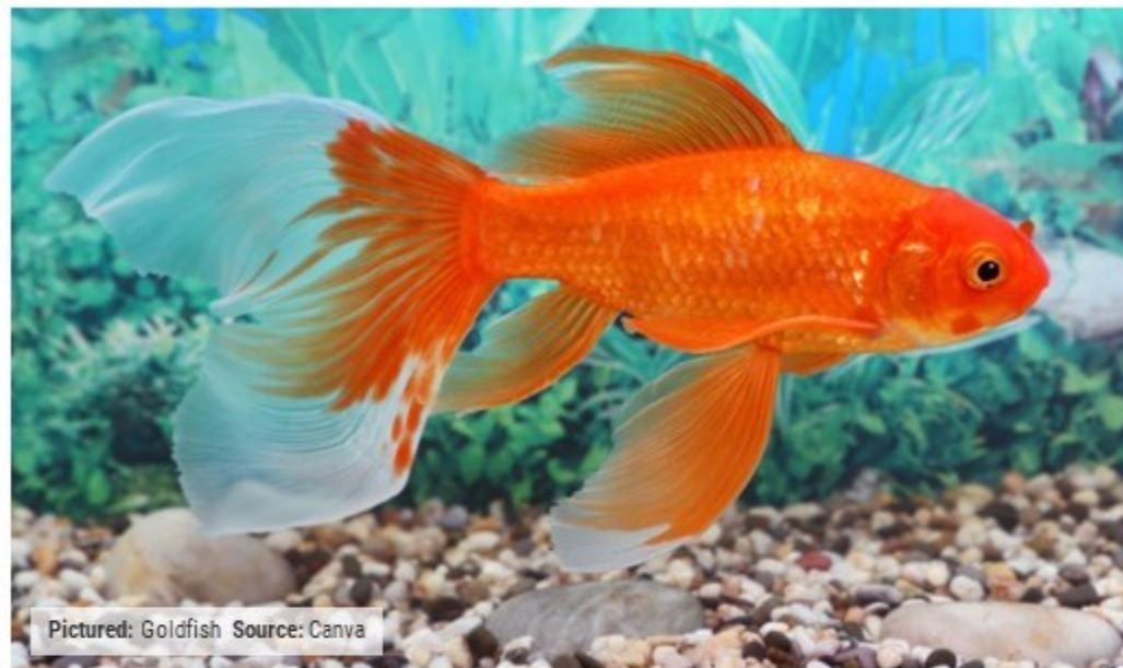
Pictured: Goldfish