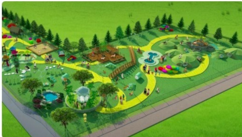
Pictured above: Emma's vision for the Dogs4Rescue site

Dogs4Rescue would like to open a dedicated sanctuary and rehabilitation retreat set in 40 acres of land, including woodland, streams, shelters and places to explore. The plan is to turn the area into the UK's largest kennel free dog sanctuary, helping many thousands of dogs in the future.