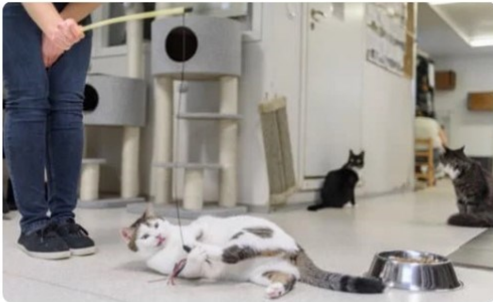
Pictured above: a volunteer playing with a cat in an animal shelter.

Not all animal shelters are the same but generally, they are an establishment that provides a temporary home for dogs, cats and/or other animals that are lost, unwanted or abandoned (this includes situations out of an owner's control). Their aim is to care for the animals until they can find suitable homes and are adopted. Animal shelters rely heavily on charitable donations.