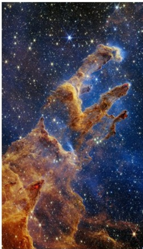
Pictured: The Webb telescope's breath-taking view of the Pillars of Creation.

Nasa's James Webb Space Telescope has taken a star-filled snap of the Pillars of Creation. This is the sharpest image ever captured of the iconic area of intense star formation, and was made possible by using the space telescope's near-infrared camera. The Pillars of Creation are in the Serpens constellation, in the Eagle Nebula, which is around 7,000 light-years from Earth. A light-year, a large unit of length used to express astronomical distances, is the distance a beam of light travels in one year. In interstellar space, light travels at approximately 300,000 kilometres per second, or 9.46 trillion kilometres per year. Nasa says, 'the ethereal scene captures translucent columns of cool interstellar gas and dust punctuated by piercing, bright points of light. Most of these are stars, and the reddish balls of fire near the edges of the pillars are newly formed stars.'