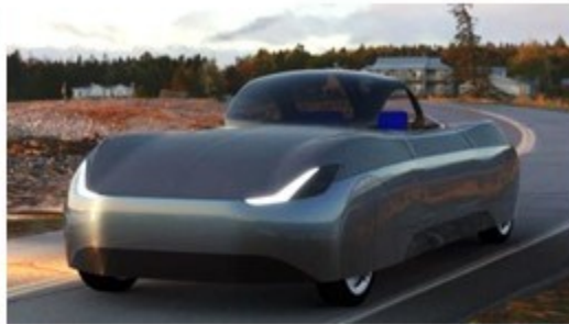
Pictured: Right - Alef's vision for its flying car, Left - the Model A flipped on its side in flight.

Alef Aeronautics recently unveiled a flying car that can turn into a biplane (a fixed-wing aircraft with two main wings stacked one above the other). The Californian firm showcased the - still in development - eVTOL Model A and Alef Zero flying cars. The Alef Model A has a meshed body that conceals eight propellers, which allow it to take off from the road with no need for a runway, as it rises into the air vertically. Once in flight, the car will flip on its side, so that the top is facing forward, allowing the long sides of the vehicle to become top and bottom wings, before moving through the air at up to 260 miles per hour.